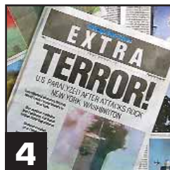
We Need The Patriot Act