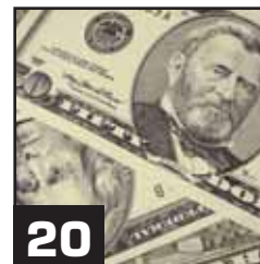
Is BCRA a Success?

The Ripon Forum (ISSN 0035-5526) is published bi-monthly by The Ripon Society. The Ripon Society is located at 1300 L Street, NW, Suite 900, Washington, DC 20005. Periodicals postage pending at Washington, DC and additional mailing offices.