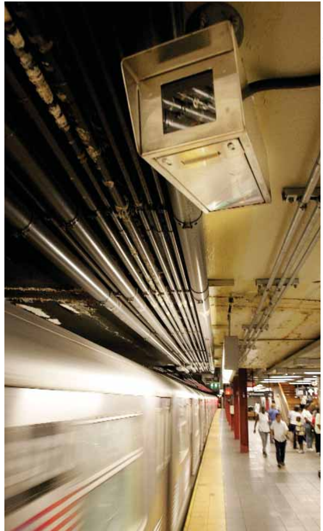
An older surveillance camera hangs over the platform in a 14th Street subway station in New York City. In the fall of 2005 The Metropolitan Transit Authority announced a $212 million system of high-tech cameras and sensors to be built by Lockheed Martin over the next three years for monitoring the subway system.

How to protect other modes of transportation from explosives is a tall challenge. The London Tube bombings in 2005 were a grim reality about the difficulty of securing mass transit against a determined enemy. In 2004, the TSA had conducted several pilot programs designed to measure the effectiveness of explosive detection equipment in the mass transit