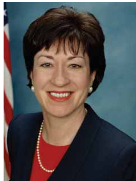
U.S. Senator Susan Collins

Third, legislation should be flexible. Our chemical industry is extremely diverse,