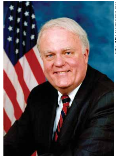
U.S. Representative Sensenbrenner

Terrorists previously had been able to exploit historic divisions between the law enforcement and intelligence communities. These divisions prevented authorities from "connecting the dots" in time to avert attacks. Without the PATRIOT Act in place, these divisions will return, and it will make detection and prevention that much harder. Without the PATRIOT Act in place, the pre-9/11 situation will return