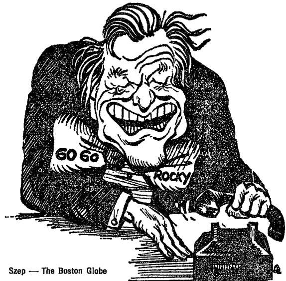
Szep — The Boston Globe