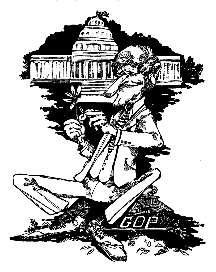
"They Love Me. They Love Me Not."