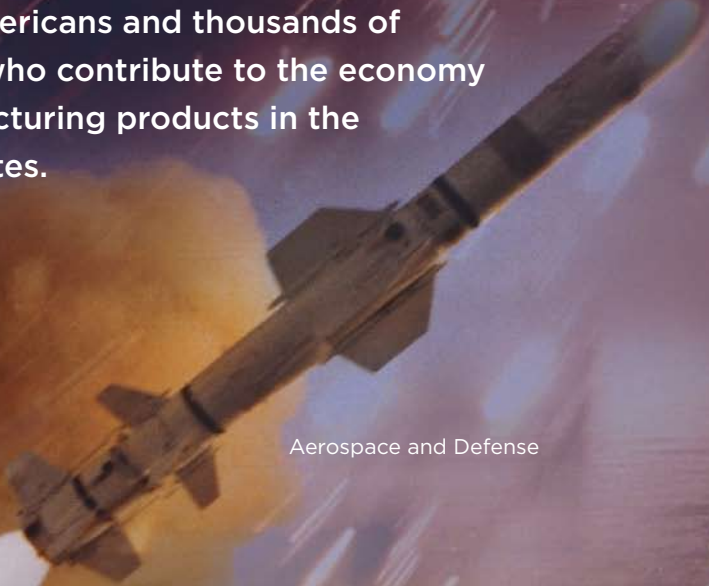
Aerospace and Defense

Tyco Electronics directly employs over 15,000 Americans and thousands of suppliers who contribute to the economy by manufacturing products in the United States.